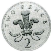
2 pence (piece)