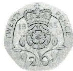
20 pence (piece)