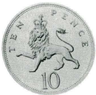
10 pence (piece)