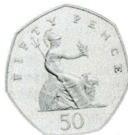
50 pence (piece)