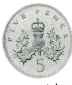
5 pence (piece)